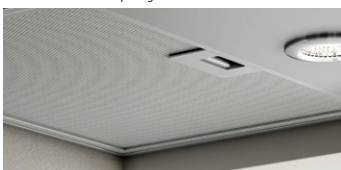
anodized aluminum mesh filters