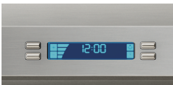
multi-function electronic controls with LCD display