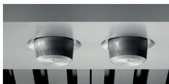
metallic rotating knob controls