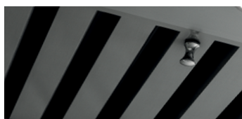
professional stainless steel baffle filters